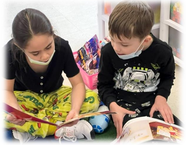
Read-a-thon and Pajama Day