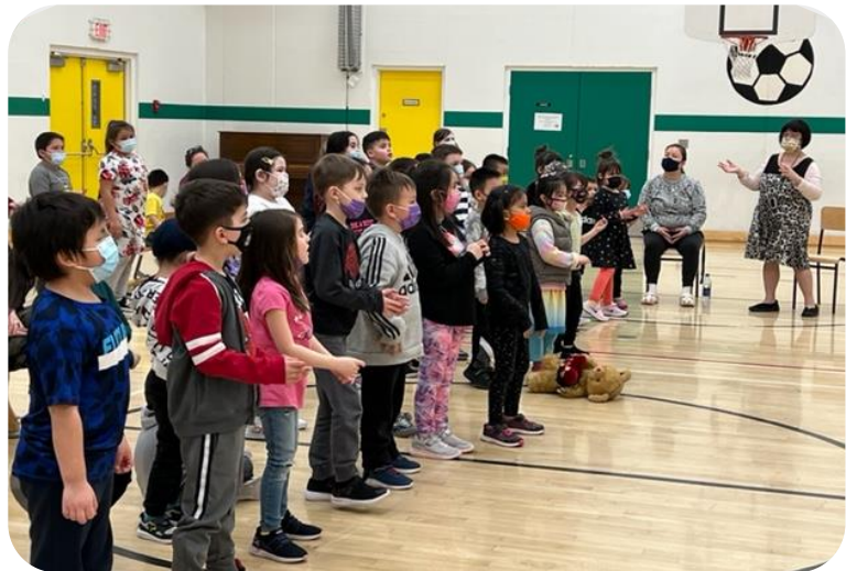
Performance by the Barefoot Caravan: Our first in-person performance in 2 years!