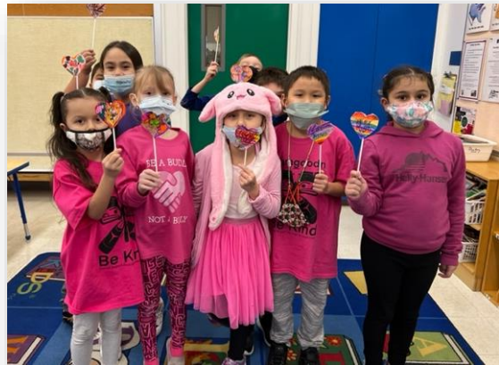
Pink Shirt Day