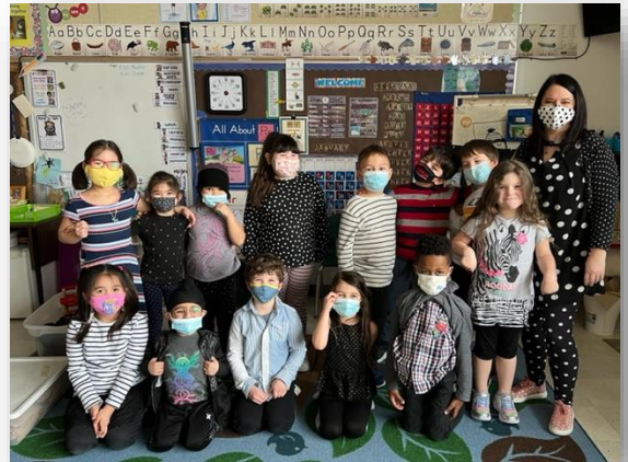
Polka Dot and Stripe Day!