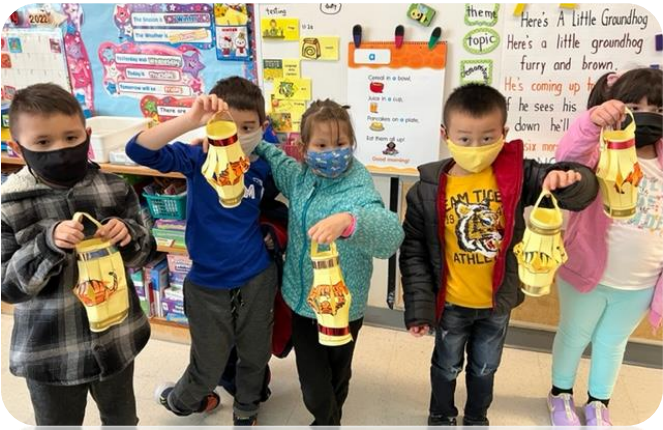
Happy Chinese New Year!